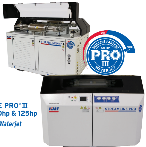
STREAMLINE PRO® III 90,000psi/60hp & 125hp World's Fastest Waterjet