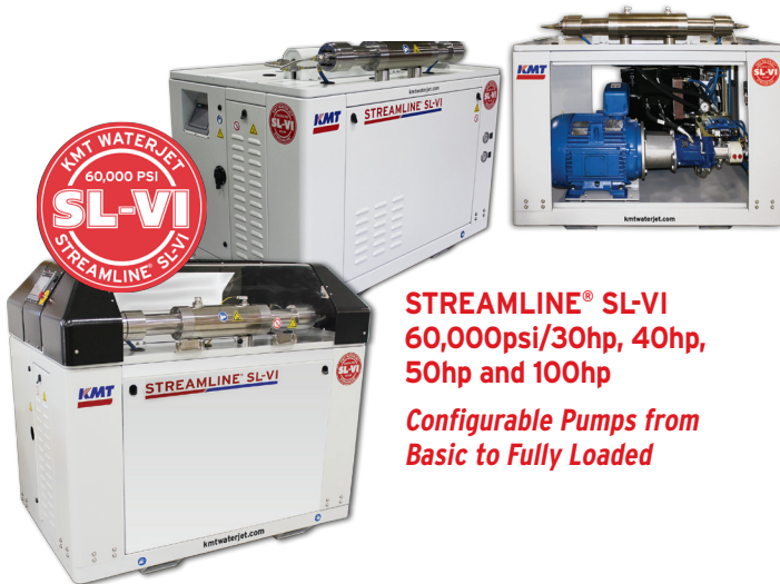
STREAMLINE® SL-VI 60,000psi/30hp, 40hp, 50hp and 100hp Configurable Pumps from Basic to Fully Loaded

KMT STREAMLINE® SL-VI pumps deliver the necessary power, productivity & performance based on your requirements ranging from 15hp-200hp & from 60,000psi to the STREAMLINE PRO®-III 90,000psi/125hp---World's Fastest Waterjet!